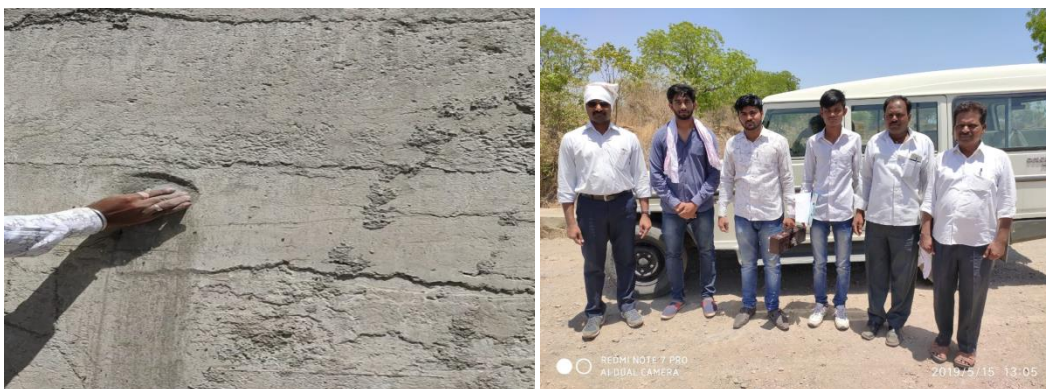
SITE VISIT PHOTOS