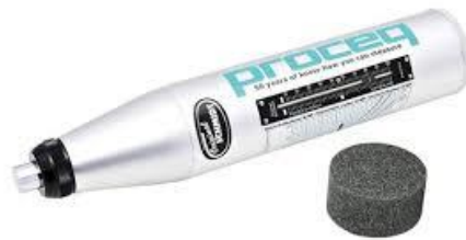
Figure 4: Rebound Hammer

The rebound hammer test measures the elastic rebound of concrete and is primarily used for estimation of concrete strength and for comparative investigation. We have used the rebound hammer test for assessing the quality of structure.