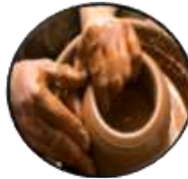
Artisans, Industries & Livelihood