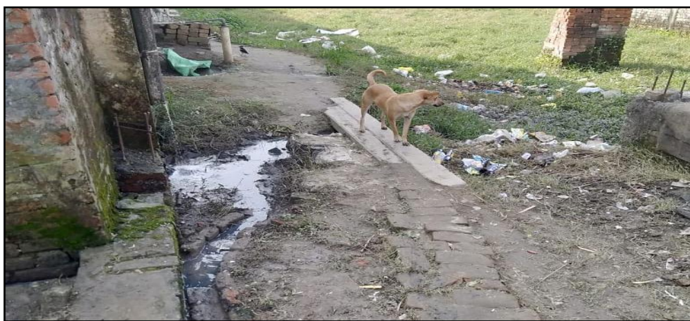
Sanitation problem due to improper disposal of solid and liquid waste