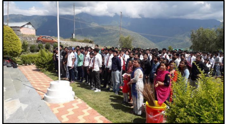
Faculty, Staff and Students Pledge ceremony