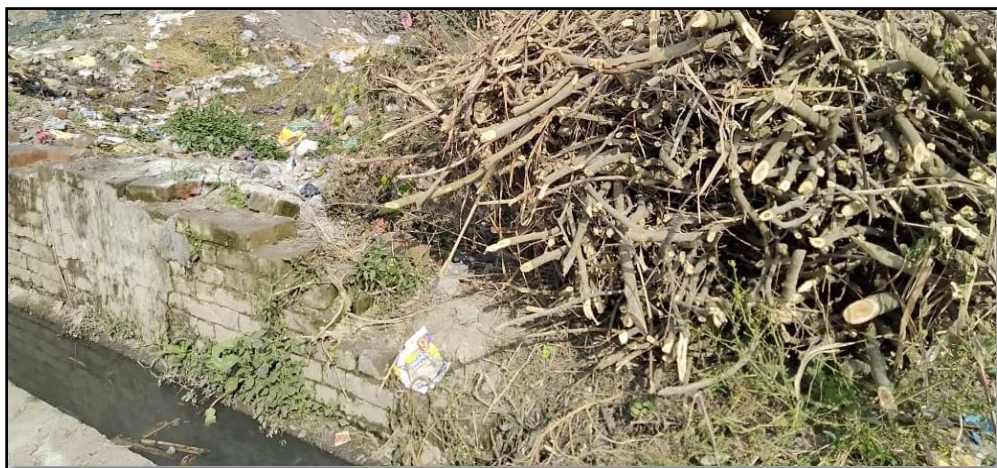
Unhygienic condition in village locality due to dumping of solid waste and flowing of contaminated water