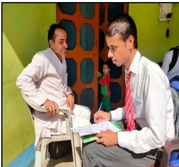
Fig 7. Student volunteer conducting household survey at Godmu-jaspur village

The UBA team of institute (comprising institute coordinator, departmental faculty coordinator of each department along with the students volunteer) visited the adopted villages. The student's team conducted household level and village level survey in Khemra , Jakh , kutha ,Painula and Godmu-Jaspur villages of Tehri Garhwal region. The household level and village level survey was conducted in all five Villages on 19 th ,23 rd October and 5 th November, 2019. To engaged and attract the local people in survey activities cloth bags & refreshment were also distributed to them.