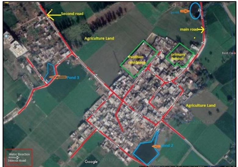
Existing drainage pattern in the village identified through ground survey