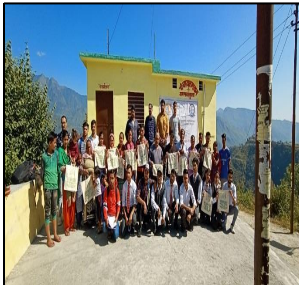
Fig 3. Cloth bag distribution at Kutha Village. peoples in Jakh Village.