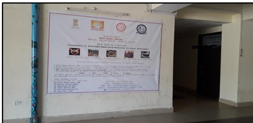
Fig 1 . Display of UBA Banner

Need of the Activity: To spread the awareness among students and faculty to contribute for rural development. The UBA banner is displayed at the prime location (way to central library) in the institute. The name of National UBA coordinator and the institute UBA coordinator is mentioned in the banner. Apart from this the name of departmental coordinator (faculty) is also display to spread awareness about the UBA program in every corner of institute.