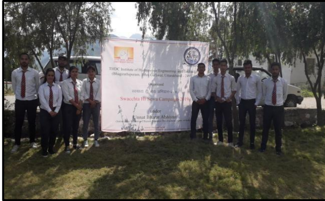
Students with UBA banner

The glimpses of activity attached below: