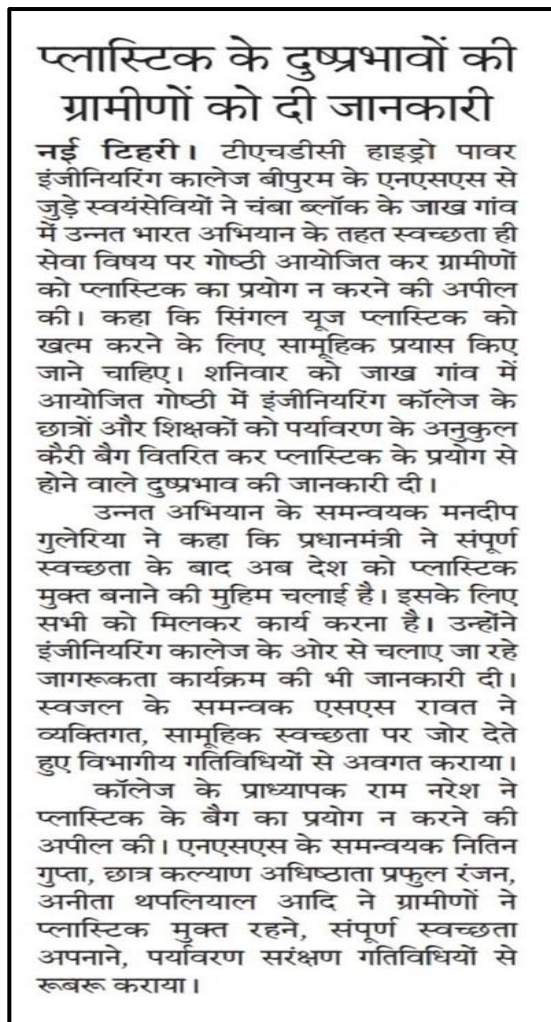
Fig 8. Dainik Jagran , 25 th October 2019