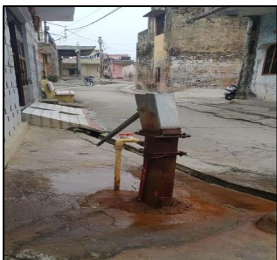
Hand pump supplying contaminated water

No health centre is available in the village. No para-medical staff and health workers are available in the village. In case of emergency, local people have to take the patient to the nearest hospital in Roorkee which is already crowded and overburdened with the patients. The lack of infrastructure in the village for sanitation causes frequent occurrence of multiple diseases and health problems. It has been informed by the village community that due to low quality drinking water and lack of hygiene conditions, diarrhea, hepatitis, typhoid and many other water borne disease are frequently occurring in the area. There is no proper drainage system in the village as a result there is mosquito breeding particularly during the monsoon season causing serious health problems. Also, no proper solid waste management system in the village is available in the village and garbage waste are openly being dumped alongside of the streets.