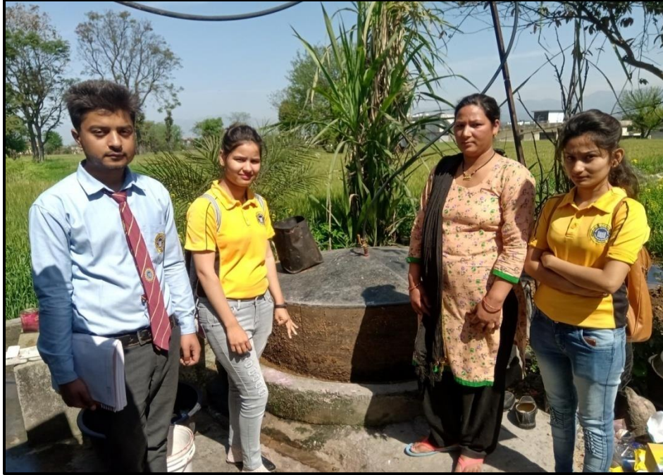
Bio-gas used by a family living in Chakmansa Village

Visit to Singhniwala Village Govt. School (6 th – 8 th ) for the Sanitation drive