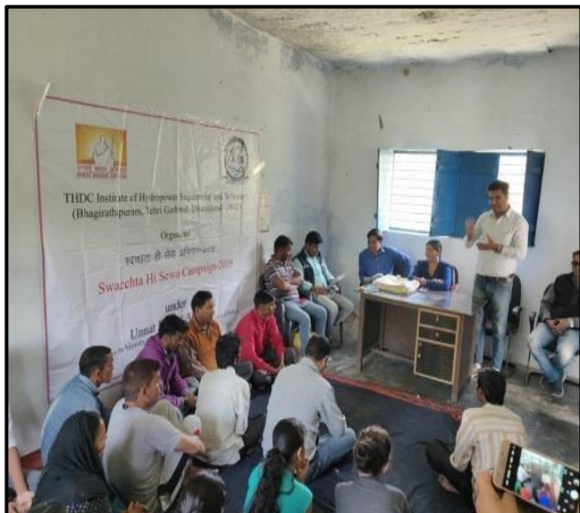
Fig 2. Institute UBA Coordinator, Addressing local

The UBA team of institute (comprising institute coordinator, departmental faculty coordinator of each department along with the students volunteer) visited the adopted villages KHEMRA, JAKH, GODMU_JASPUR, PAINULA and KUTHA. The team there met with the members of Gram Panchayat, and also organised Gram Sabha meeting in villages Panchayat Bhavan. The Institute coordinator addressed the local peoples about the vision and mission of UNNANT BHARAT ABHIYAN. Followed that Institute UBA students volunteer along with college NSS volunteers told the local peoples in villages about the harmful effects of plastic waste and motivate them to use cloth or jute bags. After that students team visited individual's households and distribute them cloth bags.