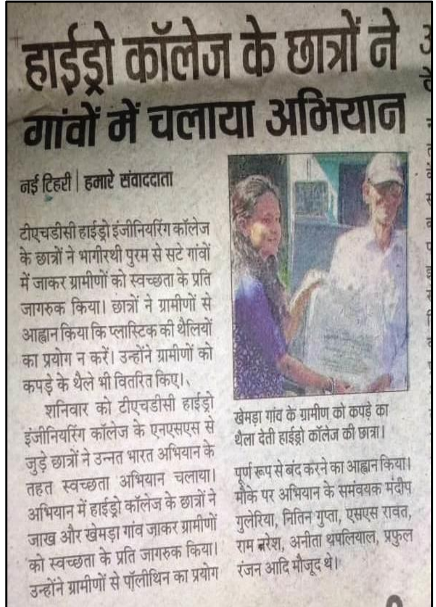
Fig 6. Hindustan, 20th October, 2019