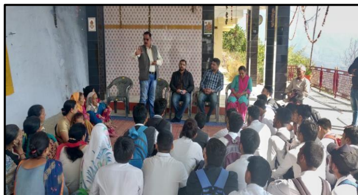
Fig. 4 UBA coordinator & Gram Pradhan , Painula Village ,addressing peoples about village development plans.