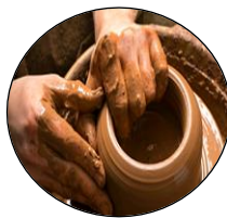
Artisans, Industries & Livelihood