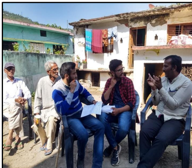
Fig 8. Student volunteers conducting survey at Khemra village