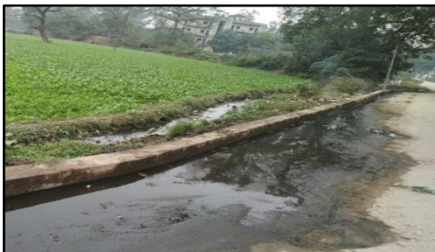
Drainage problem in the village locality