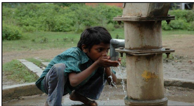
A boy drinking contaminated water from a hand pump in the village