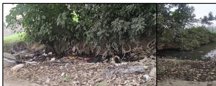
Dumping of solid wastes near one of the streets in the village