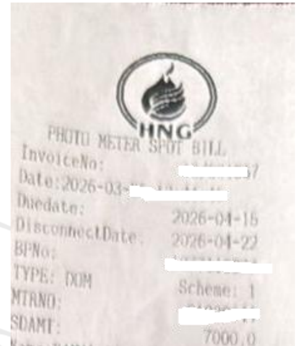
Sample of Bill