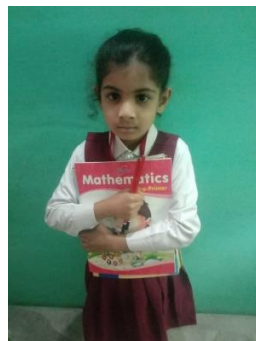
Itma Class LKG

was awarded the prize money of Rs. 5,000 and a trophy for the last year; (Lockdown delayed the prize distribution)