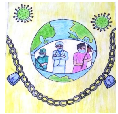
By Simran (Class VII)

AAD students are being actively involved in promoting awareness about Covid-19 prevention via such extracurricular activities to promote watchful behavior among students, their families and public during the pandemic.