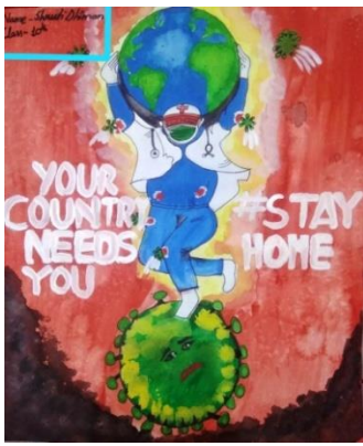
By Shruti Dhiman (Class X)