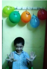
Happy family balloons

Different types of sensory and motor activities like yoga, tree plantation, making of family tree chart, Happy family balloons were organized for the students of Class Pre-Nursery to II. Students are quite interactive and take part in these with lots of enthusiasm.