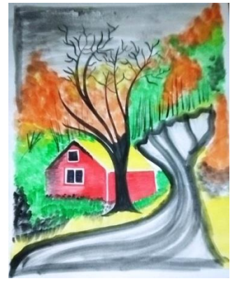
The students enjoyed Painting Classes with enthusiasm and submitted pics of their colorful creations.