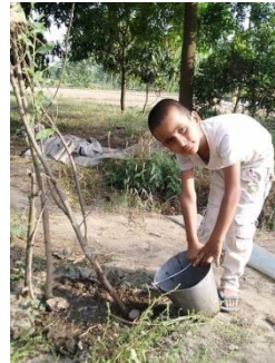
Earth day celebration

On 10 th May, 2020 – the school celebrated ‘Mother’s day’ by telling the importance of the mother and asking the students to make a collage work for their mothers and gifting it to them.