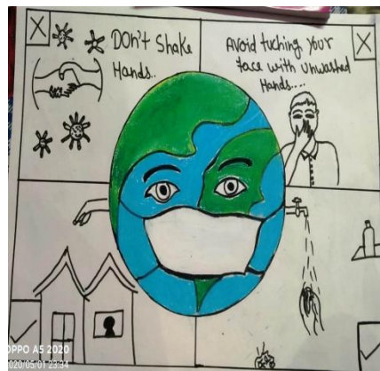
Corona virus contest