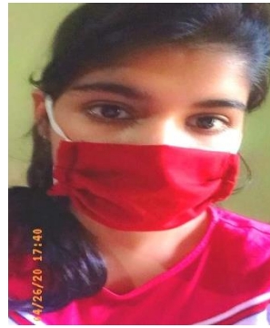
Vocational Training was given to students on making a Mask at home

On 22 nd April, 2020 ,‘Earth’s day’ the students were shown a video on ‘How to protect our Mother Earth’ and were asked to water indoor plants or those in the garden. The students actively indulged in watering the plants and shared their pics.