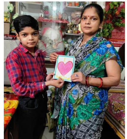
Mother’s day celebration