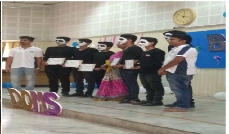
BHOR organized by DOMS, IIT Roorkee